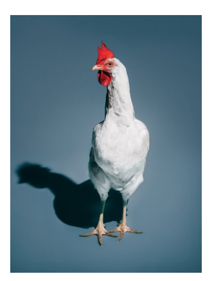
If lab-meat startup Memphis Meats has its way, this chicken and its brethren will lead vastly different lives.

The business case for clean meat, as the fledgling industry's progenitors prefer to call it, could hardly be plainer. As emerging middle classes in places like China and India adopt Western-style diets, global consumption of animal protein skyrockets. (Memphis Meats is working on duck because it's so popular in China, which consumes more of it than the rest of the world combined.) But the U.N.'s Food and Agriculture Organization estimates 90 percent of the world's fish stocks are now fully exploited or dangerously overfished. More than 25 percent of Earth's available landmass and fresh water is used for raising livestock. Only one of every 25 calories a cow ingests becomes edible beef. And meat processors often must pay disposal companies to haul away their inedible tonnage--hooves, beaks, fur, cartilage.